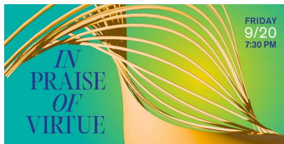
In Praise of Virtue Friday, 9/20/24 at 7:30pm Zilkha Hall, The Hobby Center