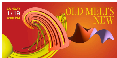
Old Meets New Sunday, 1/19/25 at 4pm Duncan Recital Hall, Rice