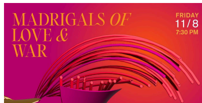
Madrigals of Love and War Friday, 11/8/24 at 7:30pm Zilkha Hall, The Hobby Center