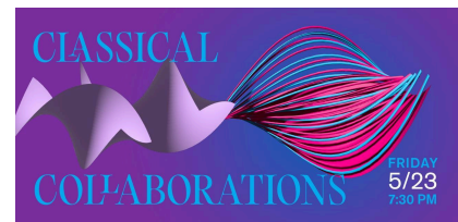
Classical Collaborations Friday, 5/23/25 at 7:30pm Zilkha Hall, The Hobby Center

Season subscriptions feature a wide range of benefits, including ticket discounts, priority seating,